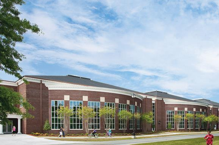
37% Electricity Reduction over 2 week period